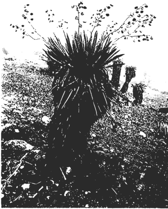
FIGURE 1. Individual of E. timotensis from the Venezuelan paramos at 4200 m. Approximate height is 2 m.